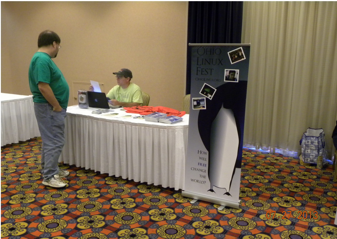
Ohio Linux Fest Promo