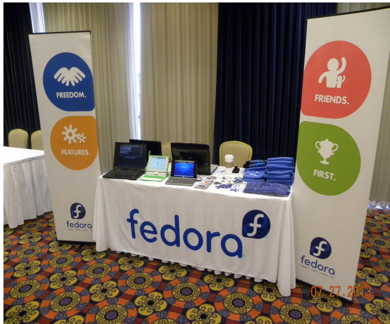
Booth Up and Ready, Taking coffee break

produced specific media and USB iso's as requested. The attendance was slow to start but progressed as the day progressed. The showing was approximately 200 through out the day. Free BSD, the Central Indiana Linux local users group, and a representative from the Ohio Linux Fest showed to promote their products and events with a total number of booths now at 7. The Fedora Booth was by far the most popular and most prepared for this event. Through out the day i did meet some interesting people, mostly users but a few stuck out, I had a few that were interested in taking enough media for their entire students in their class. I was quite happy to provide. Almost every person that stopped at the booth took both a F18 and a F19 media that I produced.