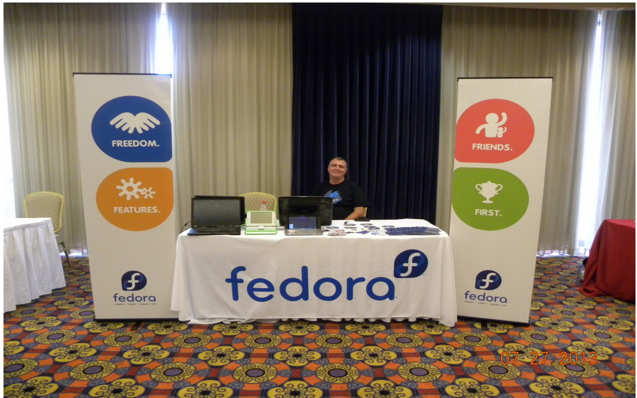
Me getting ready for the Day

I got started bright and early on Saturday at 7:30 a.m. to get things rolling. I continued to produce various F19 media for distribution later that day. The first events were scheduled for 9 a.m. and the first customers of the day showed up at 8 a.m. There was a vested interest for Fedora, with many of the questions about the difference between Fedora and other open source distributions. I was quite please to point out the various desktop environments offered by Fedora. The response was quite overwhelming for most customers that were not aware of what we did. There also was a vested interest in the other various spins we offer. I started taking names and requests for various spins customers wanted. I