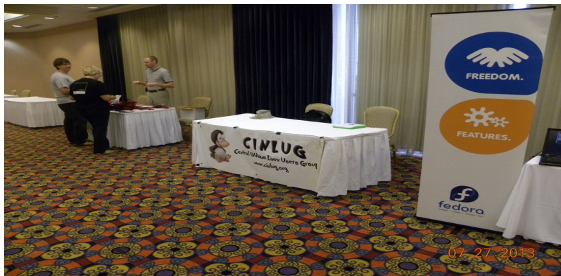
Central Indiana Linux Users Group